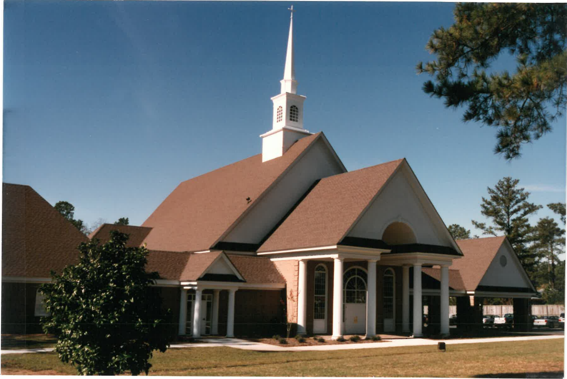
Westminister Presbyterian Church Sumter, S.C.