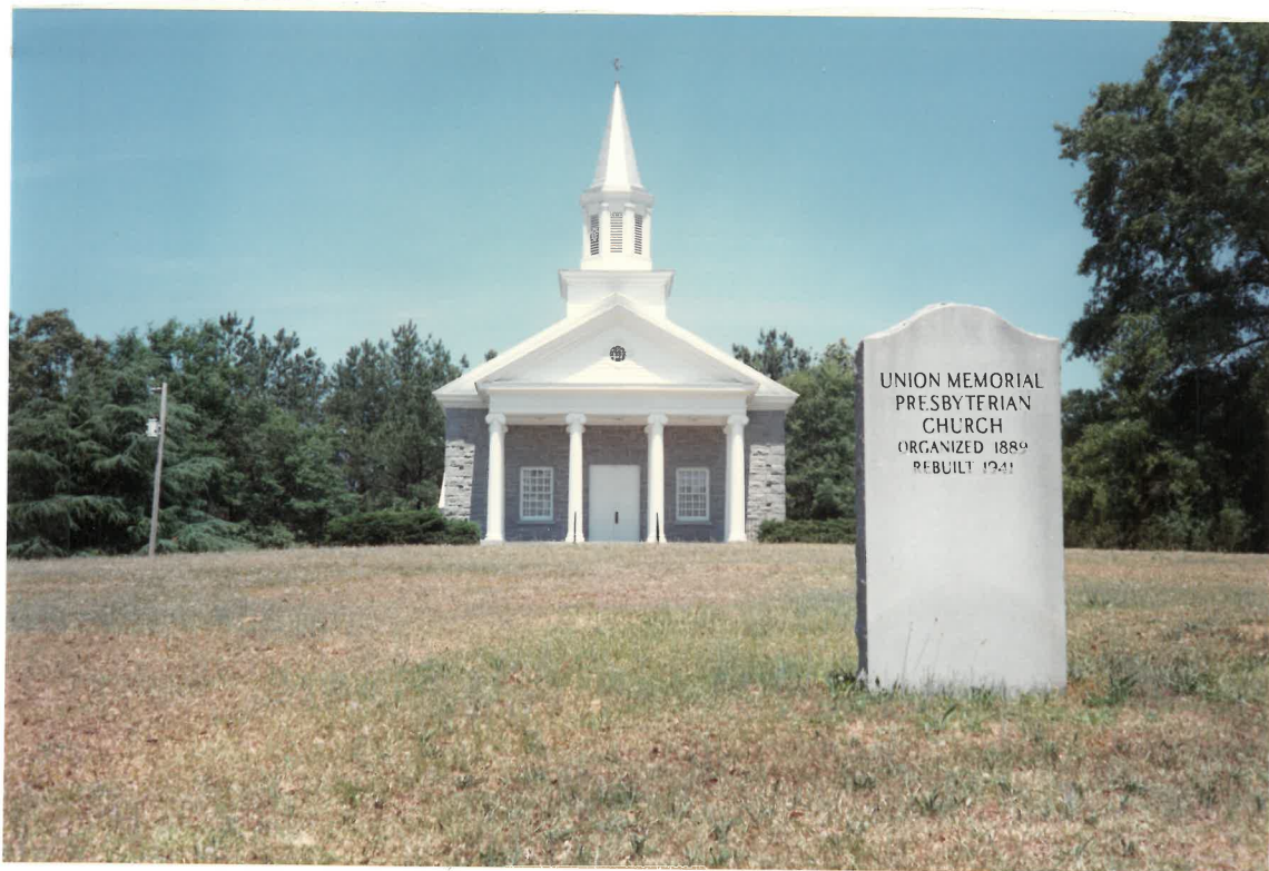
Union Memorial Presbyterian Church Winnsboro, S.C.